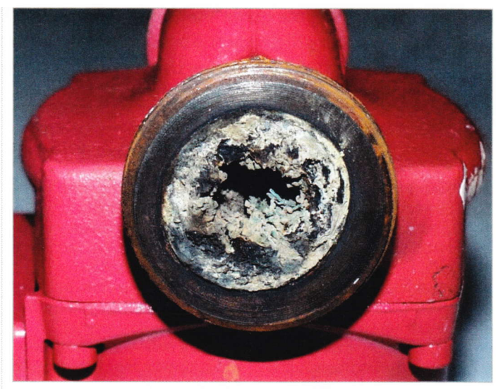
Figure 1: Magnetic corrosion debris in a circulator pump

A powerflushing magnet can only collect debris passing within a few centimetres of it. Without the assistance of a vigorous flow rate generated by a powerflushing pump, accumulated deposits will remain static within radiators and pipework, continuing to diminish the efficiency of the system. The situation is complicated by the fact that sludge and corrosion